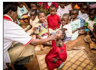
Over 300 children were dewormed

Mission for Community Development (MCODE) , Uganda, conducted a project called "Alive at Seven," educating community members about disease prevention. So far they have held workshops to train community health promoters, provided deworming to children, trained caregivers about proper mosquito net usage, (to prevent malaria), promoted breastfeeding, and distributed mosquito nets.