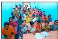
Young mothers gather for training.

Ruwwo, India , is working to empower mothers with complete knowledge of enteric diseases and skills to prevent and manage them. They have thus far conducted education programs for mothers of children less than 5 years of age in each