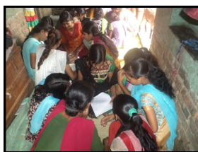
An adolescent peer group discussion

30 villages have been motivated to work with their families on these issues. Some 96 % of these children consented enthusiastically to take part in door to door campaigns. The group also held meetings with mothers and pregnant women encouraging them in better food management, boiling water, taking children for immunizations, and registering for safe delivery. As a result 75% of 1,862 pregnant women visited health centers for early registration.