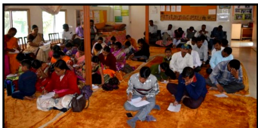
Workshop for teachers

launched a program in January 2017 in Zimbabwe. We at CHF are happy too!